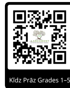
Kidz Prāz Grades 1-5